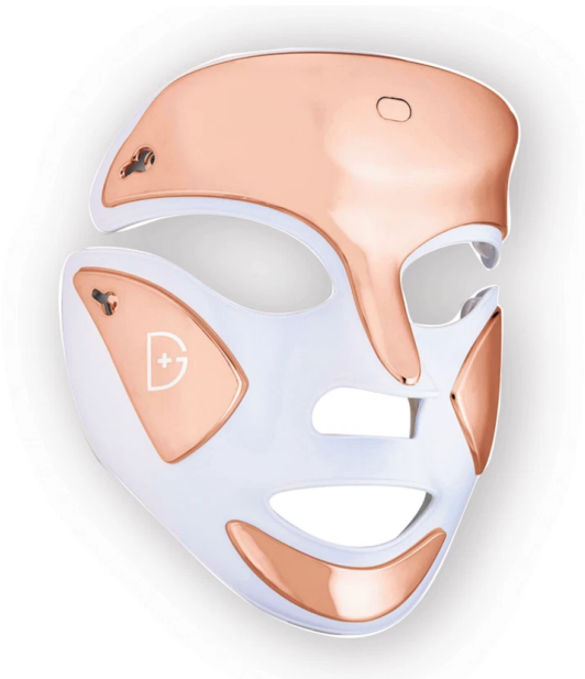
Dr. Dennis Gross Skincare DRx SpectraLite FaceWare Pro mask, $435 at Sephora.com